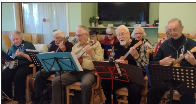
The "Ukulele Fun Band" performed for us in early January in order to kick off the new year with fun & interactive jolly tunes.