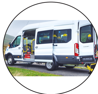
Outings into the Community