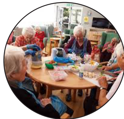
Art, Craft & Baking Workshops