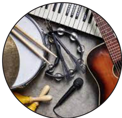
Live Musical Entertainment & sing-alongs