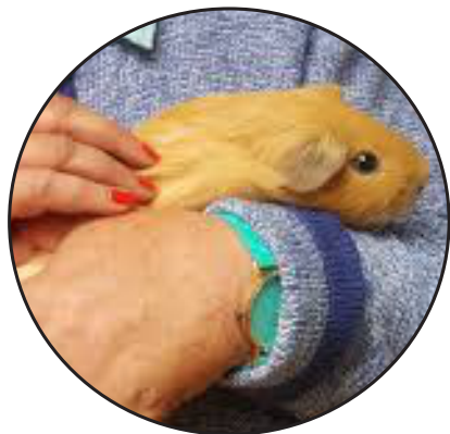
Pet & Animal Sanctuary visits