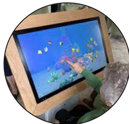
Digital Interactive Activity Table