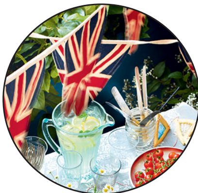
Theme Days & Special Events, such as "1940's Day"